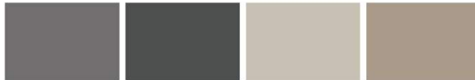
2303 anthracite grey