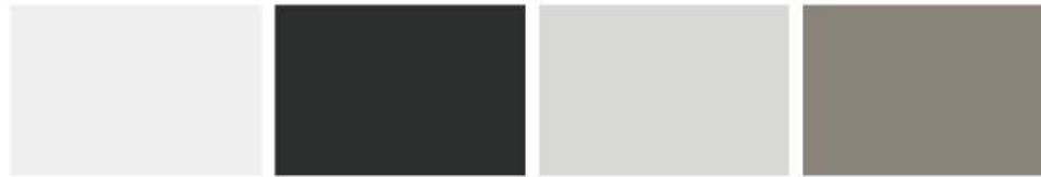
2101 snow white