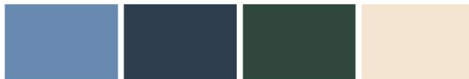
2601 baby blue