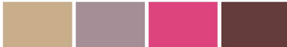
2403 carmel beige